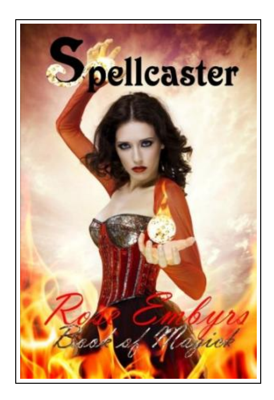
Filesize: 2.99 MB